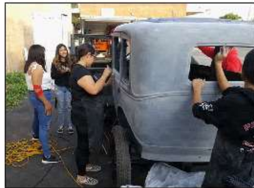
Final sanding and detailing.

Below students are shown performing final preparation on a newly primed (by students), 1929 Model A Murray body, Fordor Sedan.