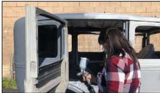
Priming before applying final paint color.

We receive no funding from the local school district, nor assistance from MAFCA. We rely solely on our annual raffle. For each one hundred dollars ($100.00) contributed, the donor receives one raffle entry. Odds of winning are fabulous, given we limit the number of entries sold. Additional cash prizes will also be awarded. We encourage those who can purchase multiple tickets to do so, and for that we express our sincere gratitude.