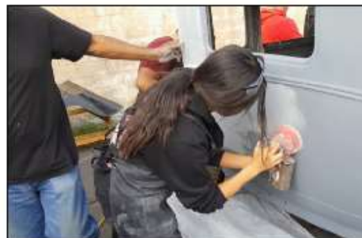
Students learn the use of power tools.