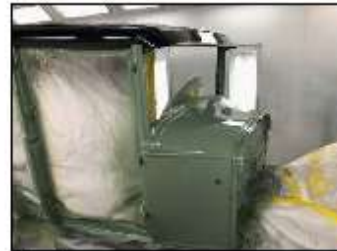
Application of color to vehicle soon to be owned by a lucky family.